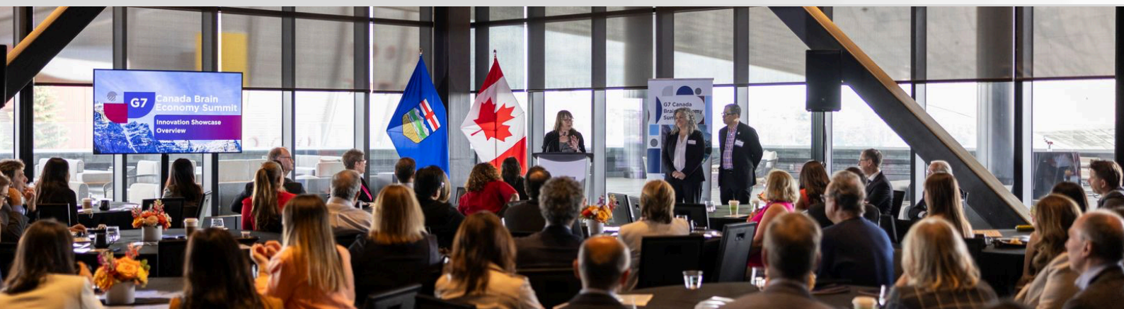
NHCC participated in the Brain Economy Summit (Calgary), held prior to the 2025 G7 in Kananaskis

Strategic advocacy work toward a National Health Survey with Santis Health (a professional government relations firm)