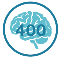
Different Types of Neurological Conditions

Neurological Health Charities Canada (NHCC) brings organizations together to address these challenges collectively. By aligning voices across conditions, NHCC strengthens advocacy, supports evidence-informed decision-making, and helps ensure that neurological health remains a national priority.