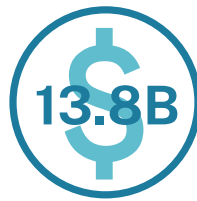
Growth in Healthcare Costs by 2031