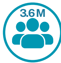
Canadians Diagnosed with a Brain Condition