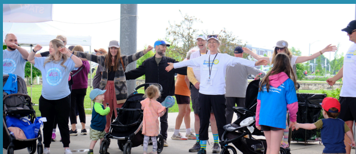
DMRF Canada & Hydrocephalus Canada at their Joint Walk in Toronto

“Our collective impact is far greater than what any one organization could achieve on its own.” — March of Dimes Canada