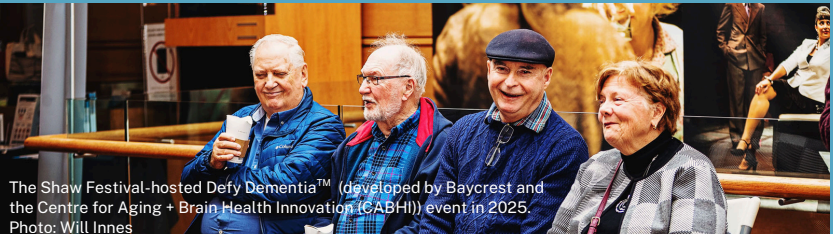
The Shaw Festival-hosted Defy Dementia™ (developed by Baycrest and the Centre for Aging + Brain Health Innovation (CABHI)) event in 2025.

Nearly 1 million Canadians could be living with dementia by 2030, and it is projected to cost over $110 billion annually by 2050